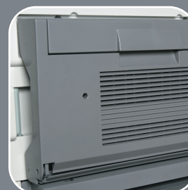
Duplex copying that is quick and easy, to save filing space and paper expense