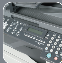
Fax-copy control panel with easy-to-use fax/scan/copy buttons and LCD screen

True multitasking lets the members of your workgroup utilize the multiple functions of the DOCUJET 3816/3820 Series simultaneously. One member of your group can print while another is scanning or sending and receiving faxes. The multitasking capability of the DOCUJET 3816/3820 Series improves overall office productivity while saving valuable office space.